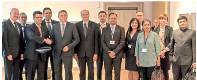
CII delegation in Germany

In Thuringia, the delegates interacted with officials of the State Development Corporation of Thuringia, and visited companies and industrial areas. The delegation also participated in a conference on India Business Day at Thuringia.