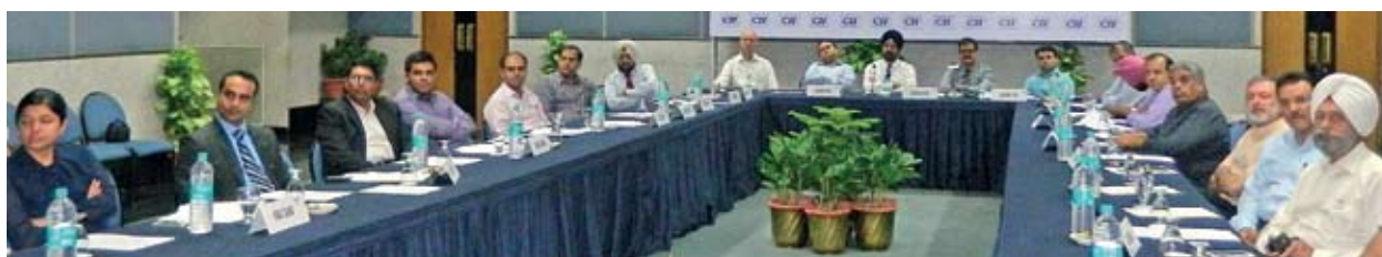
Session on 'Make in India' campaign in Chandigarh

Sessions were organized at multiple locations to mark the launch of the 'Make in India' campaign by the Prime Minister of India.