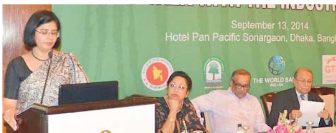
At the 2nd Global Tiger Stocktaking Conference in Dhaka, Bangladesh