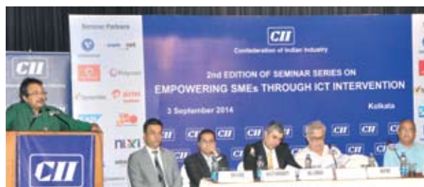
Seminar on ICT for SMEs in Howrah