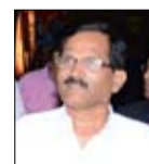
Shripad Yesso Naik, Minister of State of Tourism & Culture

The attendees included erstwhile royals like Princess Diya Kumari, Maharaja Gaj Singh Ji of Jodhpur, Shriji Arvind Singh Ji Mewar of Udaipur, and Maharani Rohini