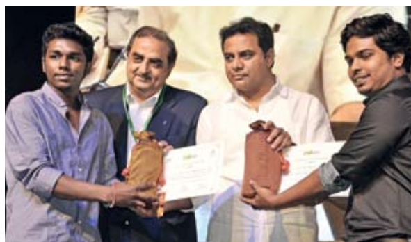
Winner of the IGBC Green Design contest

Green-I Contest: Students of Smt Ramkuwar Devi Fomra Vivekananda Vidyalaya, Chennai, received the first prize in the Green-I Contest, which is held to encourage students to think about conservation and sustainability measures that can be incorporated for a better tomorrow.