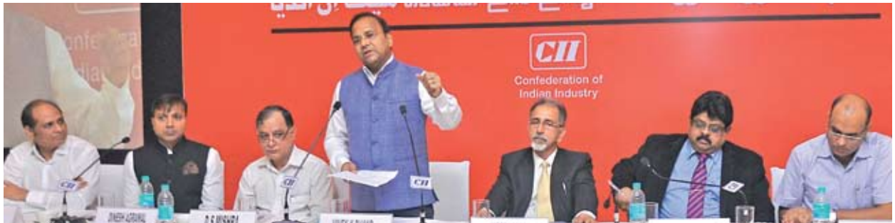
Discussion on the 'Make in India' initiative in Raipur

how the States could integrate with the core vision of the campaign by taking suitable measures to create an industry-friendly environment. The sessions were organized in association with the Department of Industrial Policy and Promotion (DIPP).