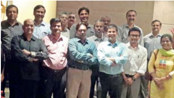
Workshop on 'Innovation and Knowledge Management: From Best Practices to Next Practices' in New Delhi

IT services, knowledge processes and electronics, representing companies such as Maruti Suzuki, Faively Transport, Aditya Birla, CGI, Robert Bosch, RINL, Bhilai Steel and BEL, among others.