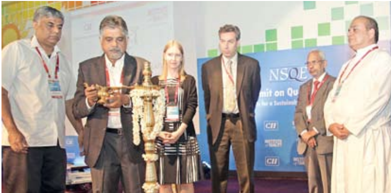
At the National Summit on Quality in Education in Bengaluru

INSTITUTE of QUALITY (Sponsored by ABB Limited)