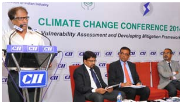
At the Climate Change Conference in Kolkata

At the Climate Change Conference 2014, Dr Sudarsan Ghosh Dastidar, Minister of Environment, West Bengal, announced that the State Government would install solar panels in 100 schools and Government-run hospitals across 19 districts in the State as part of its plans to "make West Bengal a model in green movement in the country."