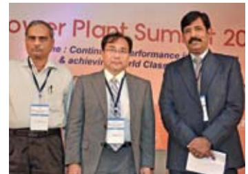
At the opening session of Power Plant Summit 2014 in New Delhi

The CII GBC is promoting the concept of 'Make Indian thermal power plants world class' to facilitate continuous performance improvement in Indian thermal power plants.