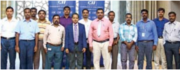
Workshop on 'Advanced Quality Tools for Defect Prevention (PM Analysis)' in Chennai

Defect Prevention (PM Analysis)' on 29-30 September in Chennai.