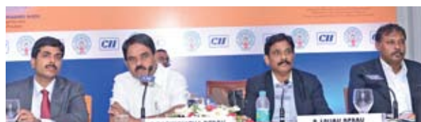
Roadshow on Andhra Pradesh in Chennai

CII Andhra Pradesh, in association with the State Government, organized a Roadshow on Andhra Pradesh - IT, Electronics, Innovation and Start up Policies.