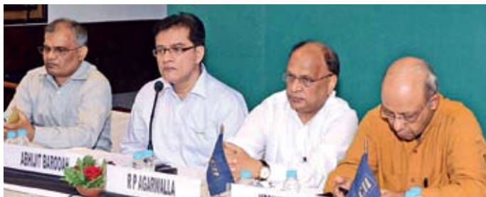
Roundtable on 'Wildlife Conservation-Role of Industry as an Enabler,' in Guwahati