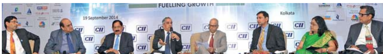
At the Banking Colloquium in Kolkata

Investments and savings cannot be seen in isolation: