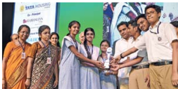
Student winners of the Green-I Contest