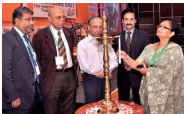
At Healthcare East, In Kolkata