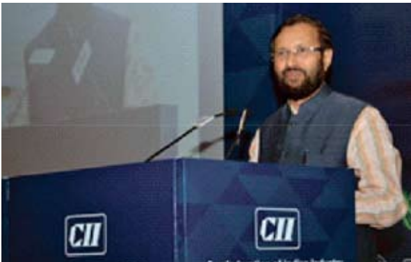
Prakash Javadekar , Minister of State of Environment, Forest and Climate Change (I/C), Information and Broadcasting (I/C), and Parliamentary Affairs, addressing the Sustainable and Inclusive Solutions Summit, in New Delhi

C ompanies and Governments need to take decisions while balancing both sustainability and growth, said Mr Prakash Javadekar, Minister of State of Environment, Forest and Climate Change (Independent Charge), Information and Broadcasting (Independent Charge), and Parliamentary Affairs, at the 9 th edition of the Sustainable and Inclusive Solutions Summit, organized by the CII-ITC Centre of Excellence for Sustainable Development on 16 and 17 September in New Delhi.