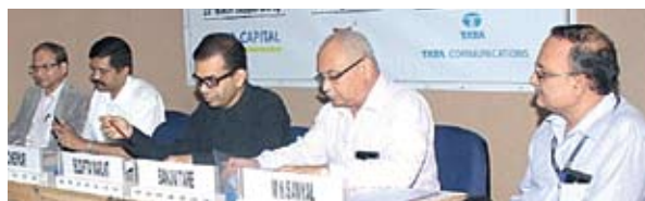
Inauguration of the the 23 rd and 24 th Batches of the CII Foundation Finishing School, in association with Symbiosis, in Pune

In 'Garnishing Talent,' another initiative, volunteers from Eaton equip students from vernacular, semi-vernacular and rural backgrounds with appropriate soft and social skills critical to individual and professional success.