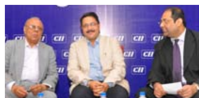
Speakers at the Design Conference in Kolkata

I-Mark, an acronym for Indian Design Mark, could be a powerful motif and tool for MSMEs to get a bigger