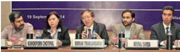
Interactive session on 'Opportunities in Thailand,' in Visakhapatnam

Thailand' promoted trade and investment relations between Thailand and India with special focus on agriculture and food processing; engineering; automobiles; electricals and electronics; chemicals and plastics, and the Services industry.