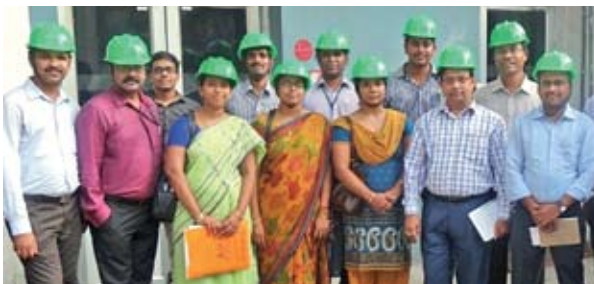
Mission Members at ITC Ltd PSPD, Bhadrachalam

CII Telangana organized a 32 member study mission on Industrial Best Practices to ITC Ltd PSPD, Bhadrachalam.