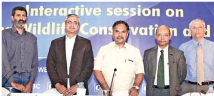
Interactive session on Balancing Wildlife Conservation and Growth in Bengaluru

The approach and work done by IWBC was recently showcased at the Second Global Tiger Stocktaking Conference in Dhaka, Bangladesh, from 14-16 September, which was inaugurated by Sheikh Hasina, Prime Minister of Bangladesh. The participants at the conference evinced interest in exploring similar Industry-led initiatives in Bangladesh in particular, and in South Asia in general. ■