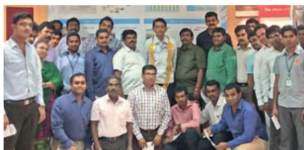
CII Team from Salem District at Toyota Kirloskar Motor Pvt Ltd, Bengaluru

A 35-member mission from Salem visited Toyota Kirloskar Motor Pvt Ltd to learn best practices to enhance competitiveness, business excellence, etc in order to compete in the global market place.