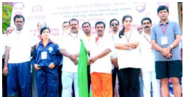
Flagging off the 3K run in Mysore

Coinciding with the Dusshera celebrations, CII Mysore organized a 3K Run for Development and Unity to showcase Industry support for this cause.