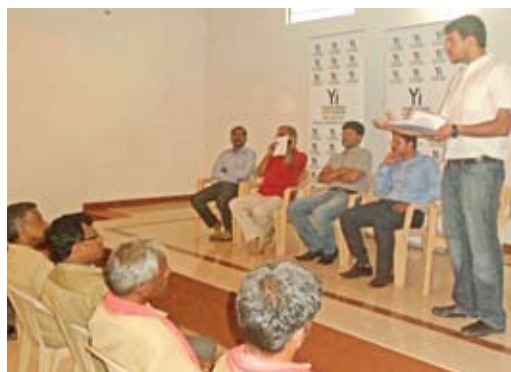
Soft Skill and Stress Management Training for Auto Drivers in Mysore