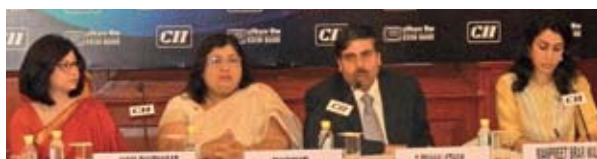
IWN Session on Finance for Women Entrepreneurs, in New Delhi

Under the aegis of the Indian Women Network-Delhi Chapter, CII, jointly with EXIM Bank, organized an interactive session to address finance-related issues for women entrepreneurs to start a business. Exim Bank also presented a case study on Gender Disaggregation of Access to Finance Data, in order to identify solutions and strategies.