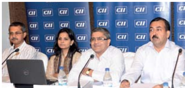
Stakeholders Consultation Meeting on Institutional Framework for Services Data Collection, in Mumbai

This meeting apprised corporates of the importance of sharing data and assuring its confidentiality and secrecy.