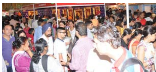
Visitors at the Thailand Trade Show in Chandigarh

The 5-day Business to Consumer (B2C) fair, jointly organized by CII and the Department of International Trade Promotion (DITP), Ministry of Commerce, Thailand, showcased the offerings of 30 Thai companies, with a special stall of Thai Airways and Tourism. B2B meetings between traders, manufacturers and distributors of the two countries were also facilitated.