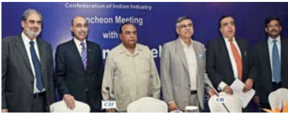
Members of the India-Pakistan Joint Business Forum, at an interaction in New Delhi

and facilitate trade within the SAARC region in order to lower production and transportation costs and eventually benefit the consumer. Trade in agricultural commodities could help bridge short term supply gaps, he suggested, highlighting the need to open more land routes to facilitate border trade, and facilitate the visa process in the two countries to promote both tourism and business. He also called for roaming facilities to be allowed for phones from one country being used in the other country.