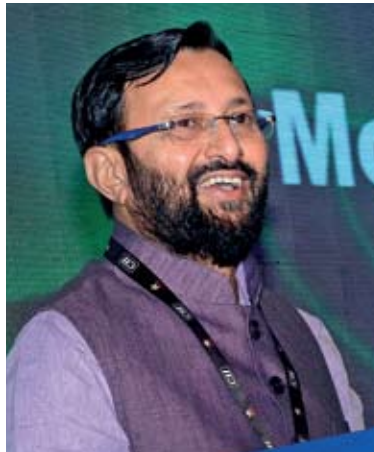
Prakash Javadekar , Minister of State of Information & Broadcasting (I/C), Environment, Forests & Climate Change (I/C) and Parliamentary Affairs, at The CII Big Picture Summit in New Delhi

T here is tremendous potential in the Media and Entertainment (M&E) sector, and a “$100 billion target is achievable” said Mr Prakash Javadekar, Minister of State of Information and Broadcasting (Independent Charge), Environment, Forest and Climate Change (Independent Charge), and Parliamentary Affairs, at the 3 rd edition of CII’s Big Picture Summit held on 19 – 20 September in New Delhi. Encouraging the industry to aim for an even more ambitious target, the Minister said that people need food, clothing and shelter, but they also need good health, education and entertainment.