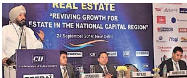
Conference on Real Estate in New Delhi

The conference provided real estate developers as well as professionals from areas such as law, finance, construction, development, brokerage and appraisal, with the opportunity to look into the future of real estate, share their expertise, and make and strengthen professional relationships. Focused State Sessions were held for Delhi and Uttar Pradesh.