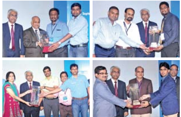
Winners in different categories at the Six Sigma Competition in Bengaluru

Several participants also requested further assistance via follow-up in-house workshops and new monthly KM meetups (KCommunity.org) in cities such as New Delhi, Visakhapatnam, Kolkata and Bhilai.