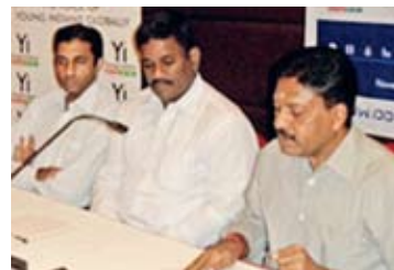
Launch of Arambam, The Start-up Contest, in Madurai

Yi Madurai, in association with Nativelead Foundation, launched Arambam, a Start-up Contest, to promote innovation, entrepreneurship and skill