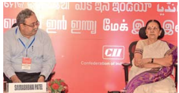
Saurabh Patel , Finance Minister of Gujarat, and Anandiben Patel , Chief Minister of Gujarat, at the launch of the 'Make in India' campaign in Gandhinagar

25 September, Bhopal, Daman, Gandhinagar, Indore, Mumbai, Panaji, and Pune