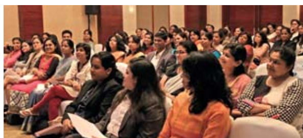
Secretary's Day Out 2014 in Pune

Pune saw a gathering of 120 secretaries from across the country at a programme developed to make them go from 'Good to Great.'