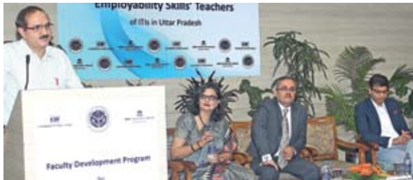
Faculty Development Programme for ITI teachers in Lucknow