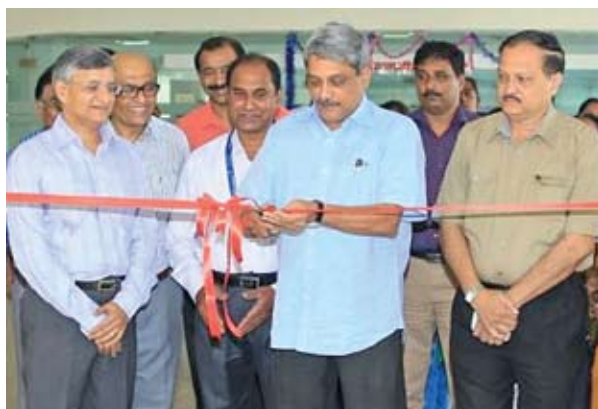
Manohar Parrikar, Chief Minister of Goa, launching the Knowledge Connect Project in Panaji