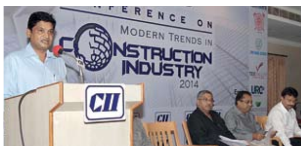
Conference on Construction Industry in Erode

CII Erode Zone, jointly with the Builders Association of India, Erode, the Erode District Civil Engineers Association, and the Indian Green Building Council (IGBC) organized a conference to discuss the latest technologies in construction engineering with the emphasis on quality and safety.