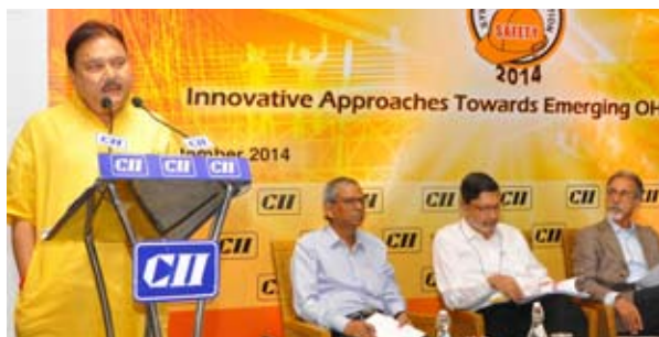
At the Safety Symposium in Kolkata