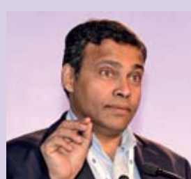
Chanda Kochhar, MD & CEO, ICICI Bank

'Digitization has changed how we work, how we relate to work and how we relate to each other and our organizations.'