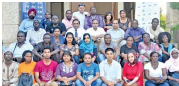
International Delegates at the CII-AVANTHA Centre for Competitiveness for SMEs in Chandigarh

The impact of various programmes conducted by the Centre was also detailed during the session. These include Joint Ventures and MoUs worth ₹ 31400 lakhs, and exports of ₹ 5000 lakhs facilitated through the Indo-German Manager Training Programme; 300% increase in turnover and ₹ 7000 lakhs annual savings reported from about 90 individual companies through Energy Management Services in the last 5 years, and savings worth ₹ 400 lakh through 8 Corrosion Services Audits. Close to 720 organisations and 1700 managers have also benefitted from 24 corrosion-related training programmes.