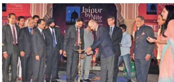
Inauguration of Jaipur by Nite, in Jaipur