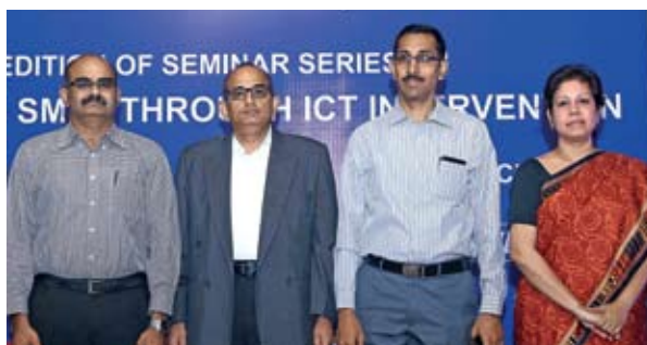
Session on ICT for SMEs in Chennai

The 2 nd edition of the Seminar Series, 'Empowering SMEs through ICT Intervention' presented best practices on ICT implementation as well as cost-effective ICT solutions to enhance business growth.