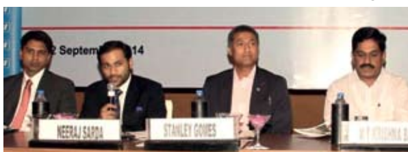
'Andhra Pradesh-Canada Infrastructure Conclave' in Visakhapatnam

CII Andhra Pradesh, in association with the Canadian Trade Office, Hyderabad, organized the 'Andhra Pradesh-Canada Infrastructure Conclave' during the