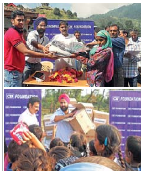
Distribution of relief material in Jammu & Kashmir