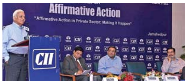
Seminar on Affirmative Action in Jamshedpur

Merit is not a standalone virtue: it is a sum total of societal, financial and environmental parameters, said Mr