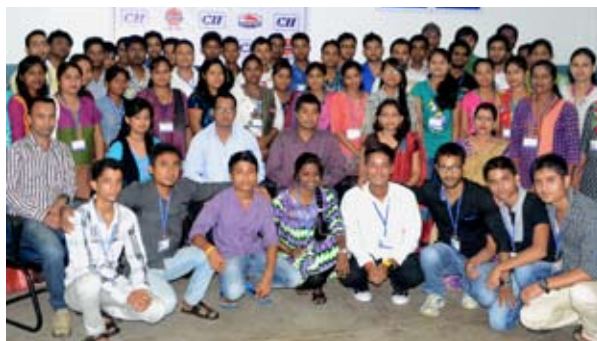
First batch of students of the OCL AOD - CII Multi Skill Development Institute, Digboi