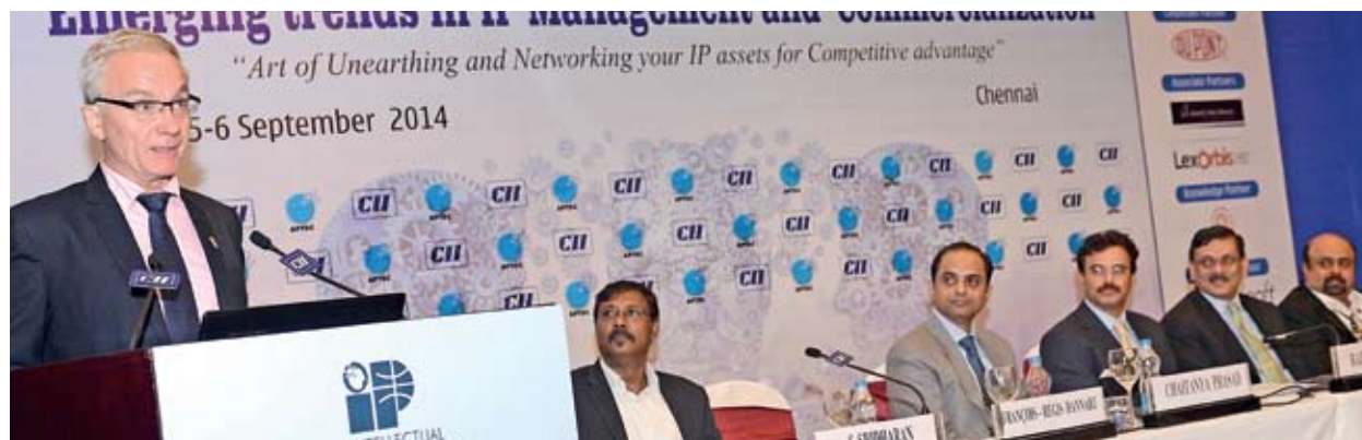
At IPEX 2014 in Chennai

The Global Innovation and Technology Alliance (GITA), on behalf of the Department of Science and