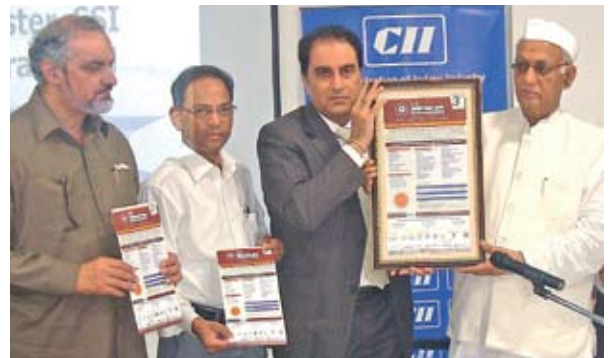
Harish Chandra Durgapal, Minister of SSI, Uttarakhand, with CII members in Haridwar

Industry members interacted with Mr Harish Durgapal, Minister of SSI, Uttarakhand, and Government officials from the Department of MSME, SIIDCUL and DIC Uttarakhand, after the formal launch of the Industrial Expo.