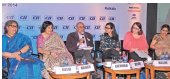
At the Conference on 'Profiles in Leadership' in Kolkata

Be confident, work hard, remain unflustered by frowns and jibes, and, more importantly, stand by