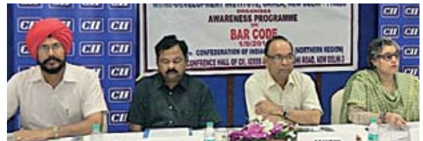
Workshop on Barcoding in New Delhi

The workshop was held to increase awareness about various Government schemes, with special focus on a scheme to promote the use of the Barcode. It also explained the reimbursement of expenses for barcode by the Ministry of MSME.