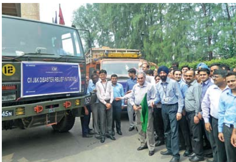
CII J & K Disaster Relief Material being flagged off from Chandigarh