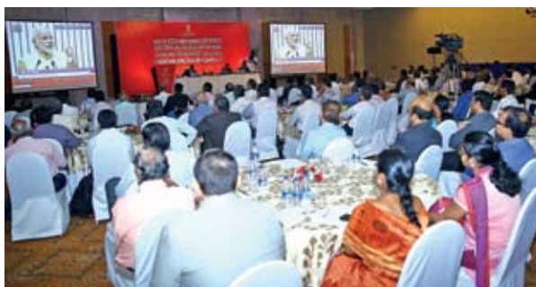
At the interactive session on the 'Make in India' Campaign in Chennai

Chennai, Vijaywada, Hyderabad, Puducherry, Bangalore, Thiruvananthapuram, Madurai and Coimbatore.