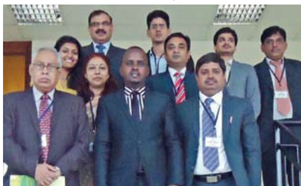
CII Delegation members with Tony Nsanganira , Minister of State of Agriculture, Rwanda, in Kigali

The Forum brought together 800 delegates, representatives of governments, businesses, and trade support institutions from 73 countries around the world, to identify practical strategies for trade-led inclusive sustainable growth and development. The CII delegation attended various sessions and held B2B meetings at the WEDF.