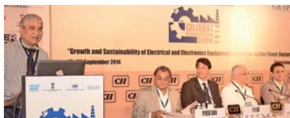
At the Gujarat Manufacturing Show 2014 in Ahmedabad

The two day conference and exhibition looked at the Indian Electrical and Electronic equipment industry, its competitiveness and key bottlenecks, and identified various enablers for its growth.