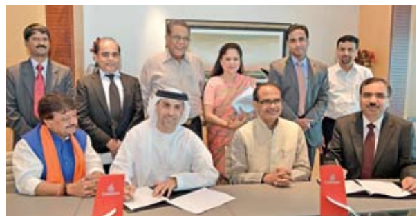
Signing of MoU between Emirates Airlines and the Government of Madhya Pradesh in Dubai